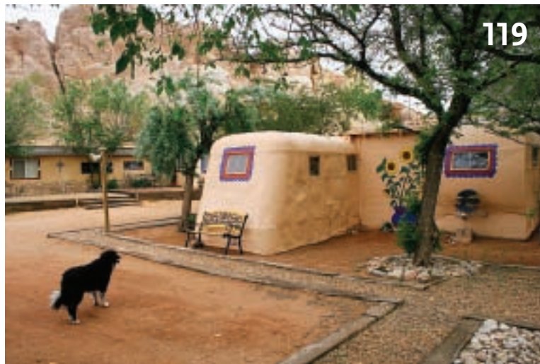
Left: Fritz Scholder, Hollywood Cowboy in Roma Above: Adobe Airstream at the Garden of the Goddess